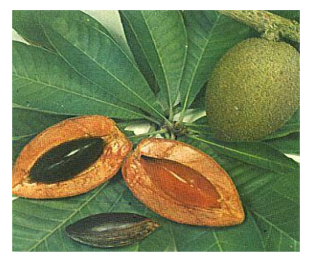
Figure 1: Sapote, Pouteria sapota

Toxicity: De la Maza, in 1893, reported that the seed has stupefying properties, and this may be due to its HCN content. One is cautioned not to rub the eyes after handling the green fruit because of the sap exuding from the cut or broken stalk. The milky sap of the tree is highly irritant to the eyes and caustic and vesicant on the skin. The leaves are reportedly poisonous [35].