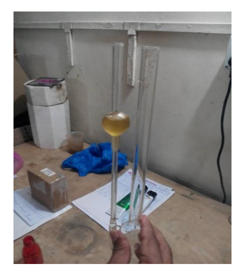
Figure 5: Viscometer

Density: Proceed as described under wt. per ml. obtain the specific gravity of the liquid by dividing the weight of the liquid contained in the Pycnometer by the weight of water contained, both determine at 25^{\circ} C unless otherwise directed in the individual monograph