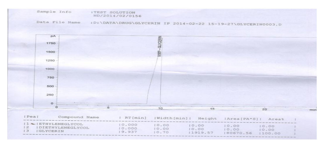
Fig 3. HPLC chromatogram of test sample

High performance liquid chromatography (HPLC) is a technique for the separation of components of mixture by differential migration through a column containing a micro particulate solid stationary phase. Solutes are transported through the column by a pressurized flow of liquid mobile phase and are detected as they are eluted. Hence the purity of refined glycerol is characterized by HPLC method. From the above Figure 2, chromatogram shows reference standard peak of ethylene glycol, diethylene glycol and glycerol eluted out at retention time4.1, 8.0 and 8.7(RT in min) respectively is compared with figure 3. HPLC chromatogram shows the sample refined glycerol peak at retention time 9.9 (RT in min) only for glycerol. By the above IR spectral and HPLC data derives the refined sample is free from impurities of ethylene glycol, diethylene glycol and other impurities. Hence crude glycerol obtained from biodiesel industry can be easily refined into pure form of glycerol, where glycerol found to be a more valuable product in cosmetics and pharmaceutical industries.